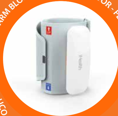
ARM BLOOD PRESSURE MONITOR - FEEL