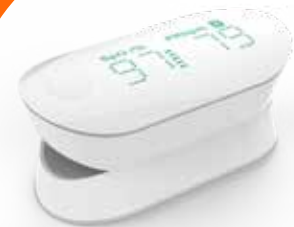
SPO2 AND PULSE - AIR