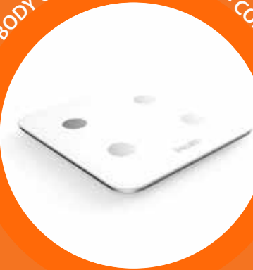
BODY COMPOSITION SCALE - CORE