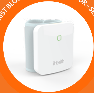
WRIST BLOOD PRESSURE MONITOR - SENSE