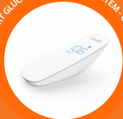
SMART GLUCOSE MONITORING SYSTEM - GLUCO