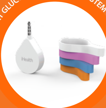
SMART GLUCOSE MONITORING SYSTEM - ALIGN