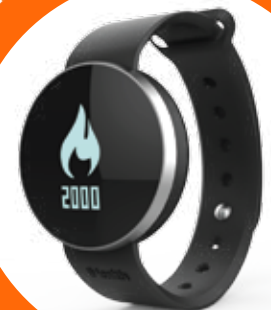
ACTIVITY AND SLEEP TRACKER - EDGE